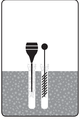
• Clean dust and other material from the hole.