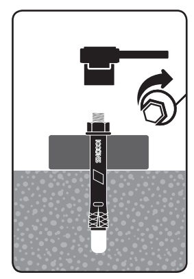
with correct size socket or spanner tighten anchor to specified torque