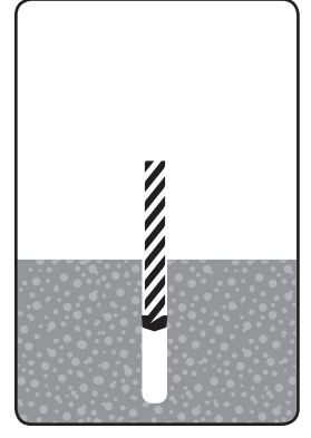
With the correct diameter drill bit, drill a hole to the correct depth