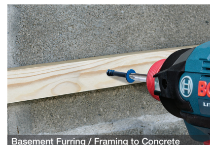
Basement Furring / Framing to Concrete