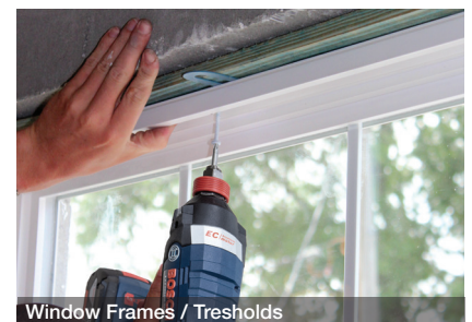
Window Frames / Thresholds