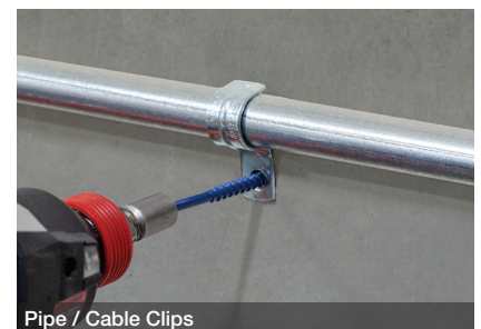
Pipe / Cable Clips