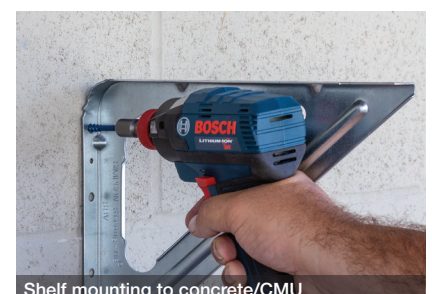
Shelf mounting to concrete/CMU