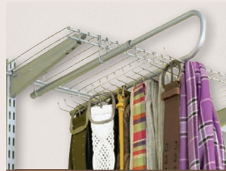
TIE AND BELT ORGANIZER 4750817