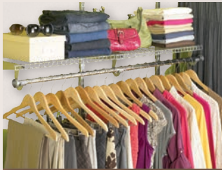
HANGING KIT 1200MM 4750814