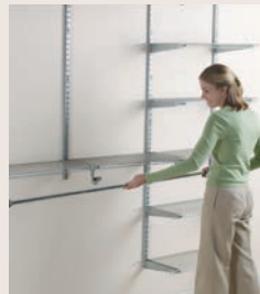
4. PLACE TELESCOPING RODS