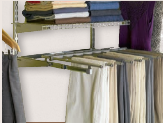
SLIDING PANTS RACK 4750820