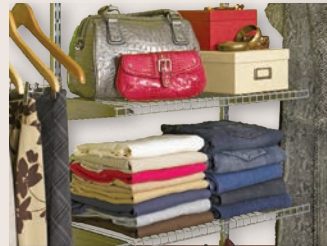
ADD ON 2 SHELF KIT 1200MM 4750813