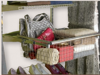
SLIDING WIRE BASKET 4750819