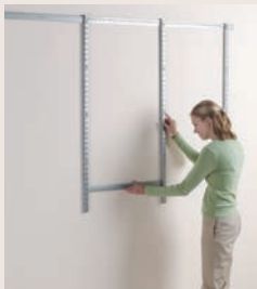
2. INSTALL UPRIGHTS