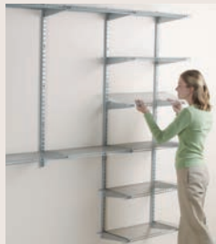
3. ATTACH BRACKETS & SHELVES