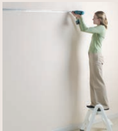
1. MOUNT OVERLAPPING RAILS